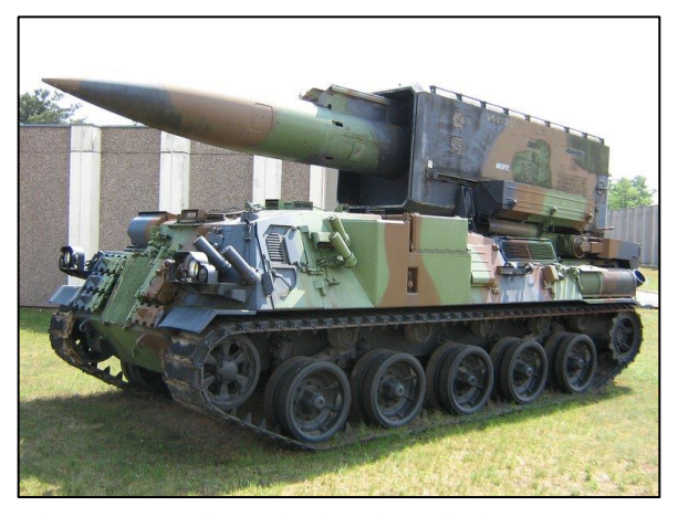
The AMX-30/Pluton displayed at Oberhoffen-sur-Moder (France).

The limited range of the missile did not allow for strikes into Warsaw Pact territory and it could only be against advancing used formations in West Germany. This was a hotly debated issue and from the German point of view seen as highly controversial. For this reason France began work on a follow-on missile called Hadès, which was to have considerably longer range and thus could be used to strike targets inside Warsaw Pact territory from