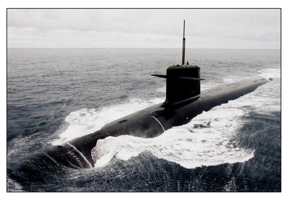
Le Triomphant SNLE-NG at sea in 2009.

It would henceforth be an incremental development of a missile family with consecutively improved range and capability. Thus "there will be no M6 nor M52 missile" but an M51.2, an M51.3 and possibly a M51.4 version. <sup>102</sup>