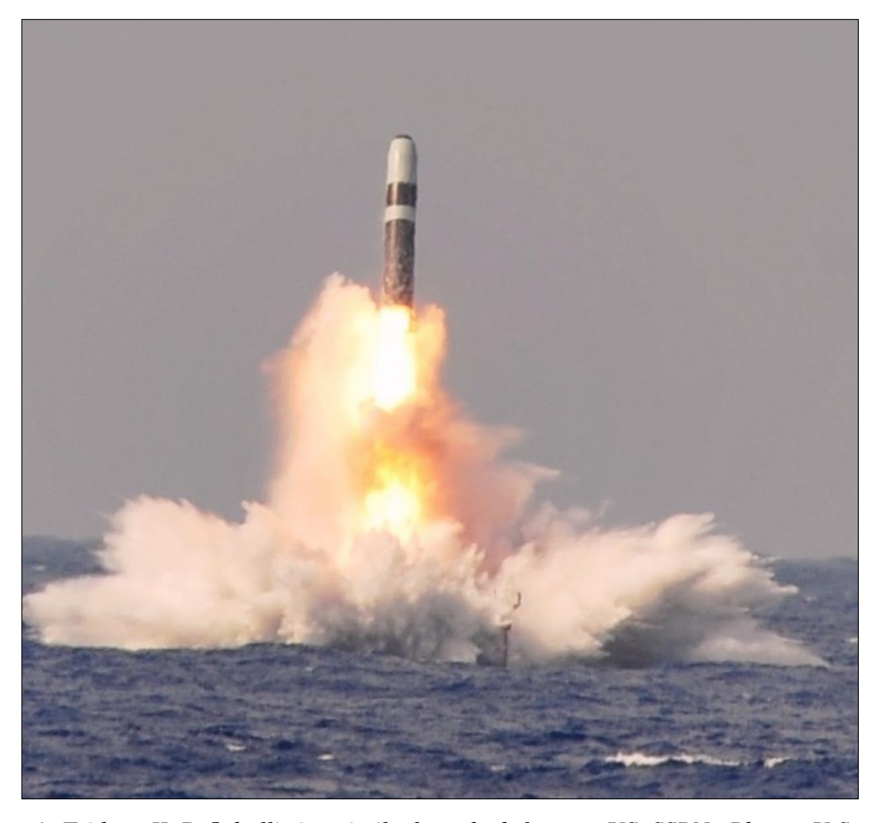
A Trident II D-5 ballistic missile launched from a US SSBN.

Majesty's Naval Base Clyde (HMNB Clyde), also known as Faslane.<sup>29</sup> Here, the maintenance of the Vanguard Class is undertaken, and all munitions, including nuclear warheads and missiles, for all Royal Navy submarines are handled at a facility in Coulport nearby. The measuring function for the submarine's magnetic signature is also part of the base's functions. A number of support ships, a diving group, and a security unit from the Royal Marines make up the support functions of HMNB Clyde. US Navy submarines can also dock at Clyde. From 2020, all British submarines will be home-ported at HMNB Clyde.