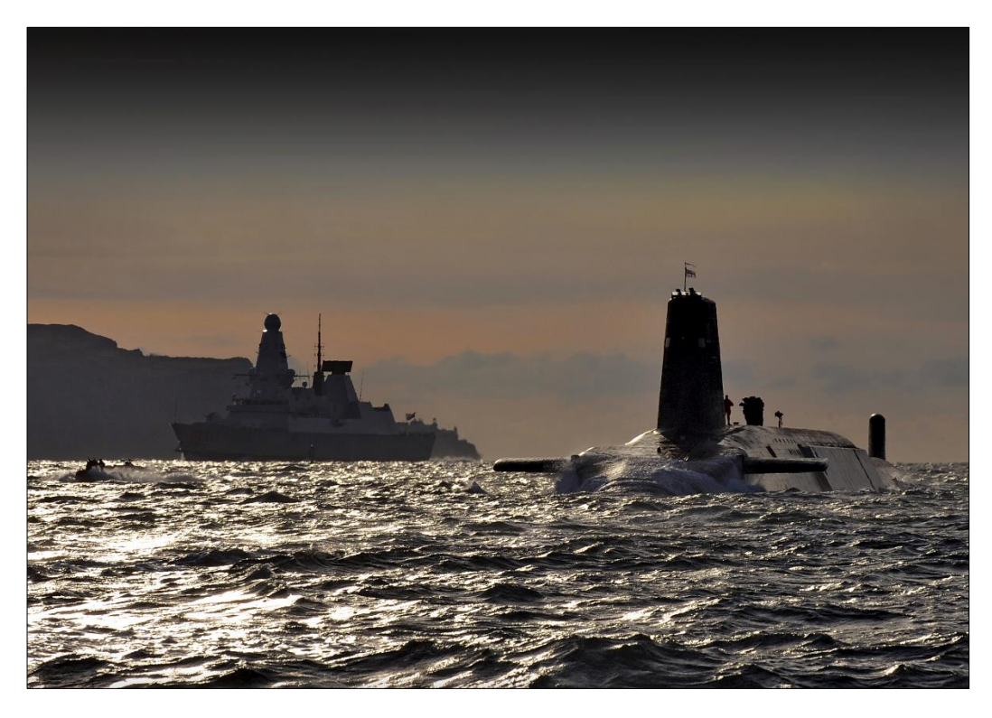
The UK SSBN HMS Vanguard returning to HMNB Faslane after patrol.