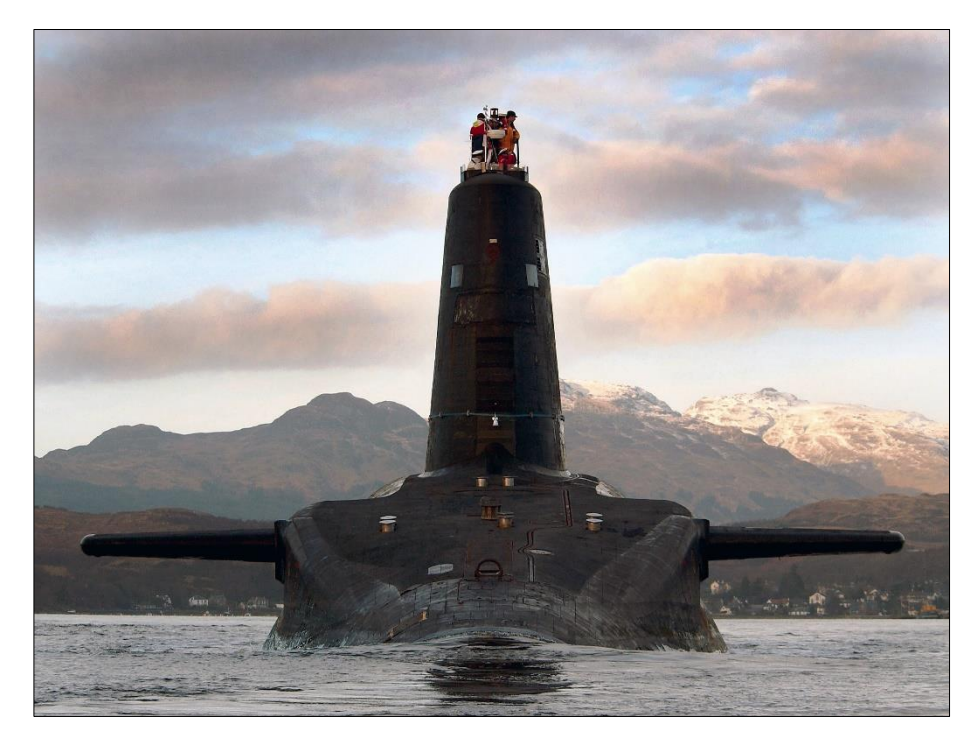
HMS Victorious, a missile-armed Vanguard Class ballistic missile submarine leaving its base at HMNB Clyde.

533-mm (21-inch) torpedo tubes armed with Spearfish torpedoes. The displacement (submerged) is 15 900 tons, the length is 149.7 metres (491 feet) and the crew complement is 135. The first SSBN in the Vanguard Class, HMS Vanguard , became operational in 1993.<sup>24</sup>