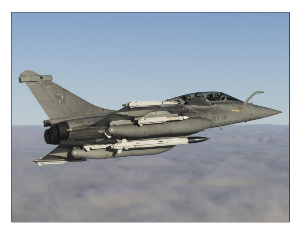
A Rafale dual-capable fighter carrying the French nuclear armed cruise missile ASMP-A.