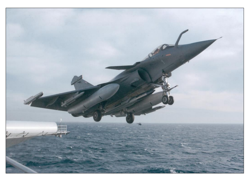
The ASMP-A on a marine version of the Rafale taking off from the French aircraft-carrier Charles de Gaulle.

The ASMP-A is also said to be much more accurate than the submarine-based missiles, which cannot be used to strike targets very precisely. Thus the ASMP-A is a complement, increasing flexibility and expanding planning options. In 2006 a military official stated that the air component can eliminate "all the centres of power (of a regional adversary) with very limited collateral damage". France can conduct long-range operations with an upper limit of about 12 hours and a proven range of over 8 000 km (in 2014 two aircraft flew a mission to the island of Réunion featuring five refuellings and 8 800 km distance covered in ten and a half hours).